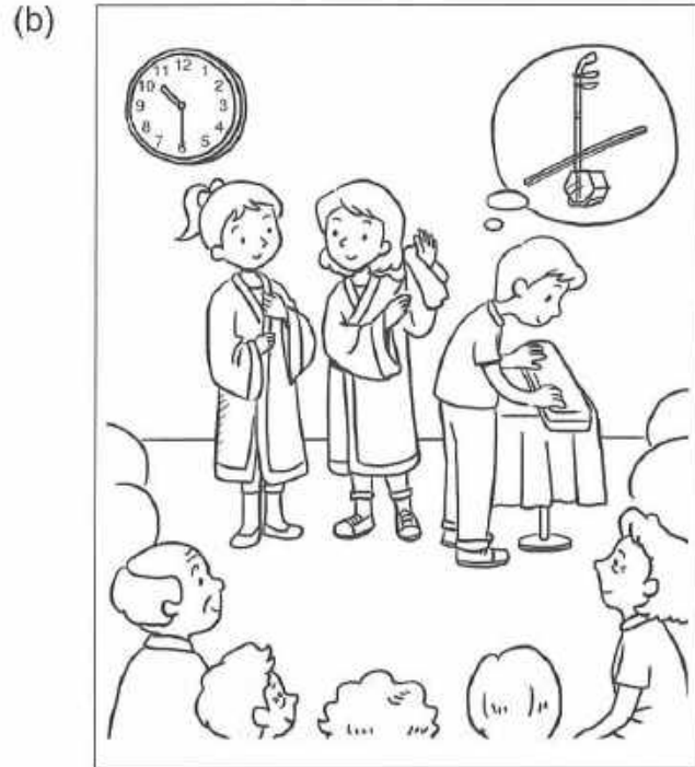
a Cantonese opera / costumes / erhu