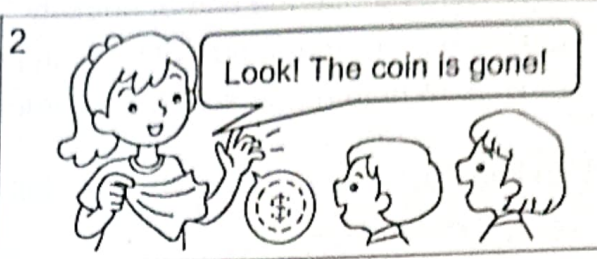
do / magic tricks / make / disappear