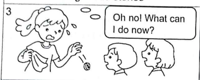
drop / shocked