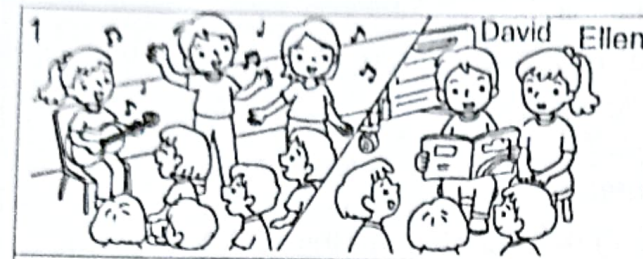
sing / read stories